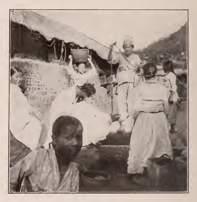
THE NEIGHBORHOOD WELL.

altitude of 5,000 feet, but the majority do not exceed 4,000 feet. The most famous of all the mountains in Korea are the Diamond Mountains in the province of Kang-Wen, "a region containing exquisite mountain and sylvan scenery," to quote the gifted author of "Korea and Her Neighbors," who made an extensive visit to them.